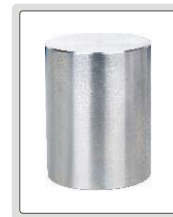
4kg weight block (optional) for ISH-S30D