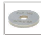
calibration block (included)